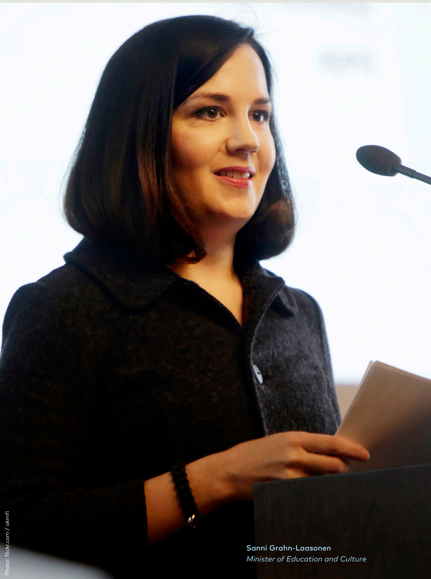
Sanni Grahn-Laasonen Minister of Education and Culture